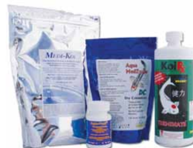
"Health Care Kit" for koi ponds up to 2,500 gallons of pond water

Our Aqua Meds koi "Health Care Kit" also includes "Step by Step" instructions for koi and pond treatments, such as the best pond water temperatures, when, how much and in what order to use the medications. Plus, we'll share with you health tips that are very simple to follow, that will help you maintain strong, happy koi and a healthy koi pond for the entire koi pond season.