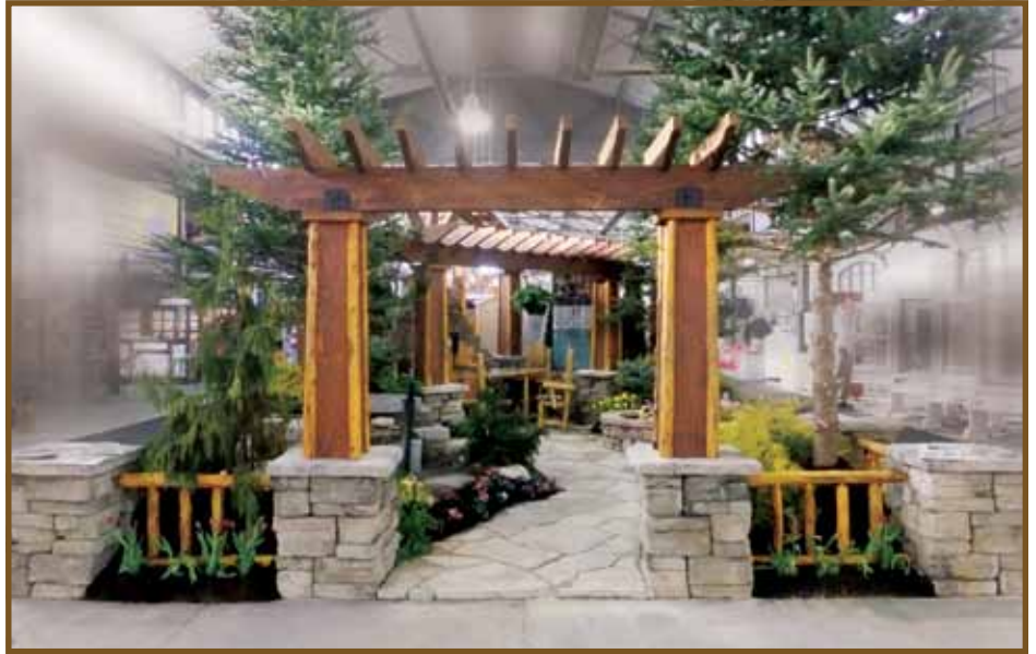
Landmasters Landscape and Construction's Garden at the 2011 Home and Garden Show featured Rosetta stone fire pit, Grand Flagstone, Belvedere collection walls, custom pergola, and pondless water feature.