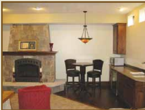
Landmasters projects this winter included finishing a basement and kitchen remodel

With the downturn in the economy there has been an influx of those who call themselves "Landscape Professionals" and certainly they are not all bad but there are those few who tell potential customers anything they want to hear. Today our money is too precious to hire someone who doesn't do a quality job. Landscaping your home is still a great return on investment but what is of even greater value is the enjoyment received while sitting in the tranquil sunshine on that perfect patio admiring the well placed plants or pond derived from a well planned and designed landscape.